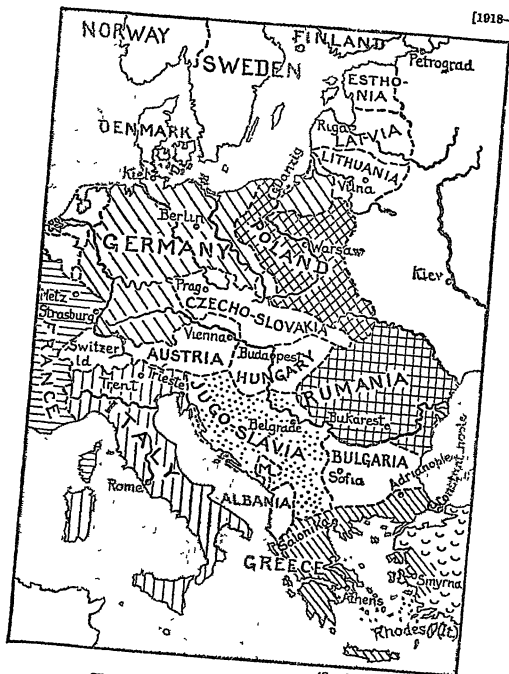
(See also folding map at end) CENTRAL AND SOUTH-EASTERN EUROPE, 1921.